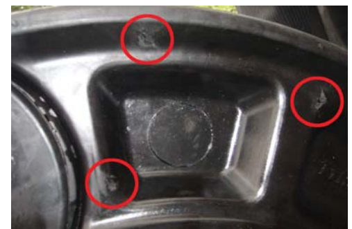
Impact is easily absorbed with no structural breakdown