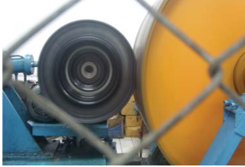
Tyron ATR undergoing load and speed testing