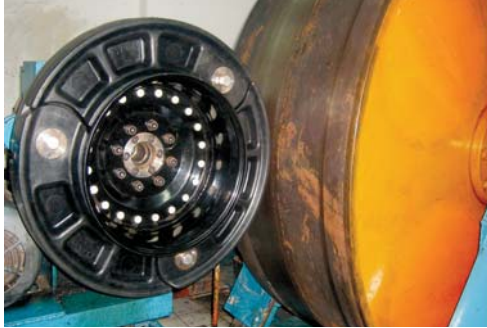
Setting up Tyron ATR for testing on a rolling road

Each extended runflat system is designed with unique elements dependant on the application and performance requirements of the customer.