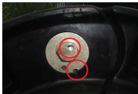
Minimum impact damage to runflat fixings