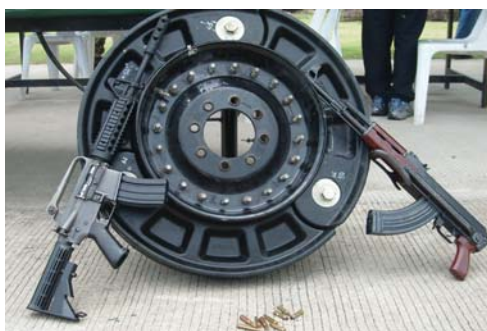
High powered assault rifles

It was therefore clearly demonstrated that under a severe ballistic attack, the Tyron ATR could not be compromised even in the event of the fixings being repeatedly hit.