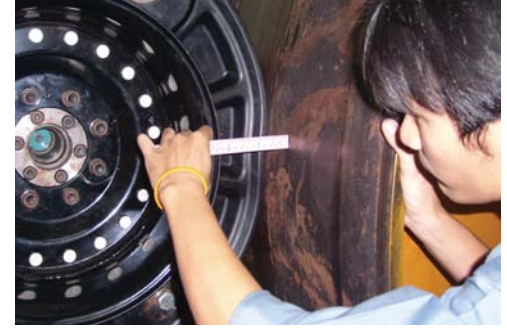
Measuring unique load deflection characteristics

"ONLY the Tyron ATR has exceeded the stated performance.... and that's with ALL 4 tires flat!"